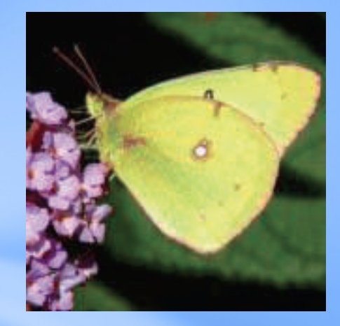
Common (Clouded) Sulfur