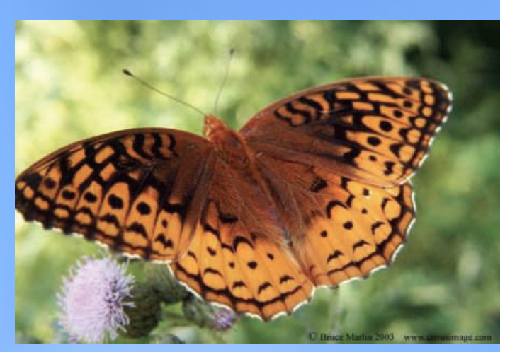
Great Spangled Fritillary

Enrichment in the Content Areas: Language Arts Secondary Example